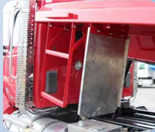
METAL OR RUBBER STONE GUARDS