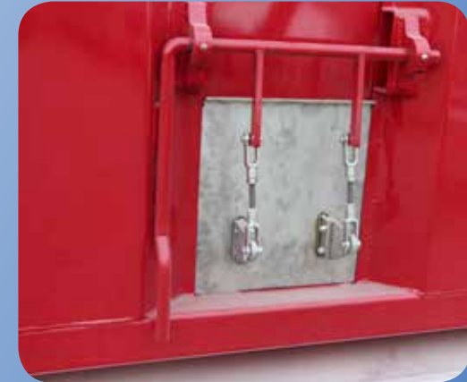
TAILGATE COAL DOOR

Tailgates are available in several different configurations and with various options.