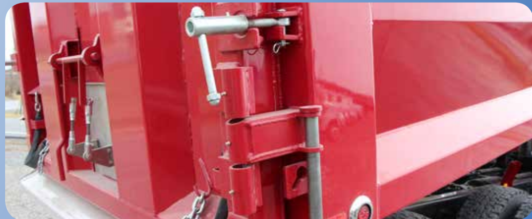
BARN DOOR OPTION ON STANDARD TAILGATE