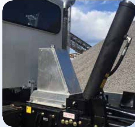
SLIM FIT HYDRAULIC TANK MOUNT