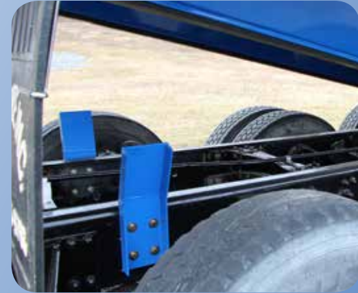
HEAVY DUTY BODY GUIDES