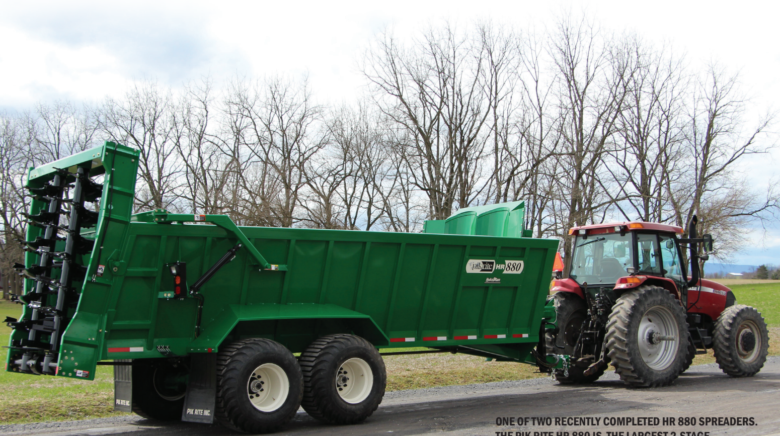
ONE OF TWO RECENTLY COMPLETED HR 880 SPREADERS. THE PIK RITE HR 880 IS THE LARGEST 2-STAGE HYDRAULIC PUSH SPREADER THAT IS MADE IN THE USA.