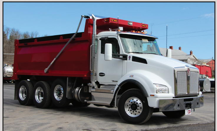
PICTURED: FOUR RECENTLY COMPLETED TANKS AND TRUCK BODIES