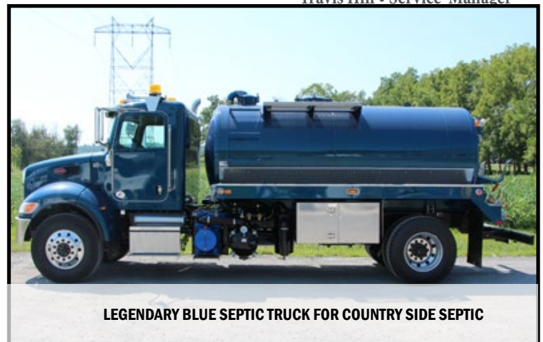
LEGENDARY BLUE SEPTIC TRUCK FOR COUNTRY SIDE SEPTIC