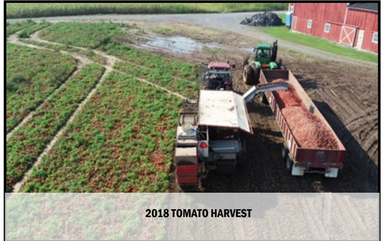
2018 TOMATO HARVEST