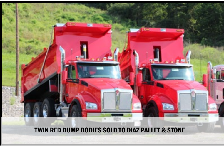
TWIN RED DUMP BODIES SOLD TO DIAZ PALLET & STONE