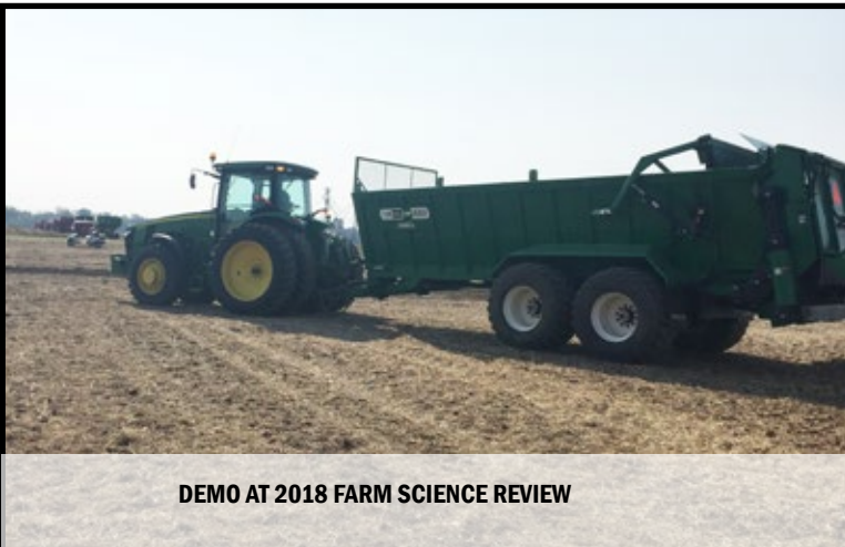
DEMO AT 2018 FARM SCIENCE REVIEW