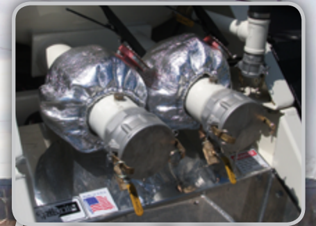
Butterfly Valves (Shown with Optional Heated Jackets)