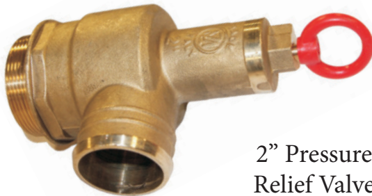
2” Pressure Relief Valve

Take advantage of this month's parts promotion! We are offering 10% off pressure and vacuum relief valves for the entire month of May.