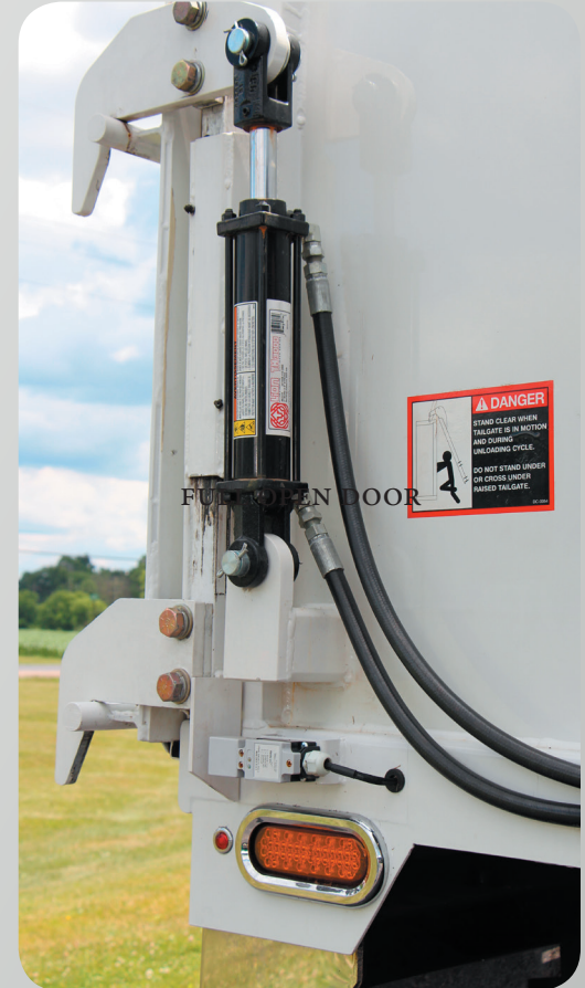
HYDRAULIC LATCH AND SAFTY SENSOR