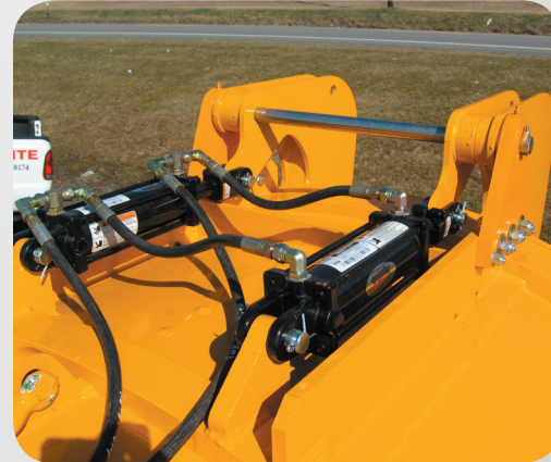
HYDRAULIC REAR DOOR