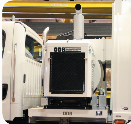
INDEPENDENT DIESEL ENGINE