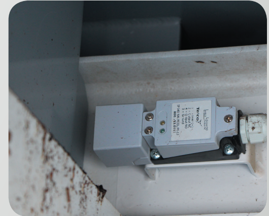
COMPACTOR SAFETY SENSOR