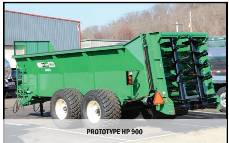
PROTOTYPE HP 900

Look for the positive around us. It’s Spring! Get outside, go for a walk! Trees are budding, early spring flowers are blooming, and the sun is rising earlier and setting later. Your time at home is an opportunity to strengthen your family relationships. You can make their day by calling a single person or your elderly neighbors, just to touch base and offer encouragement. If we look for the positive, we will find it. 📌