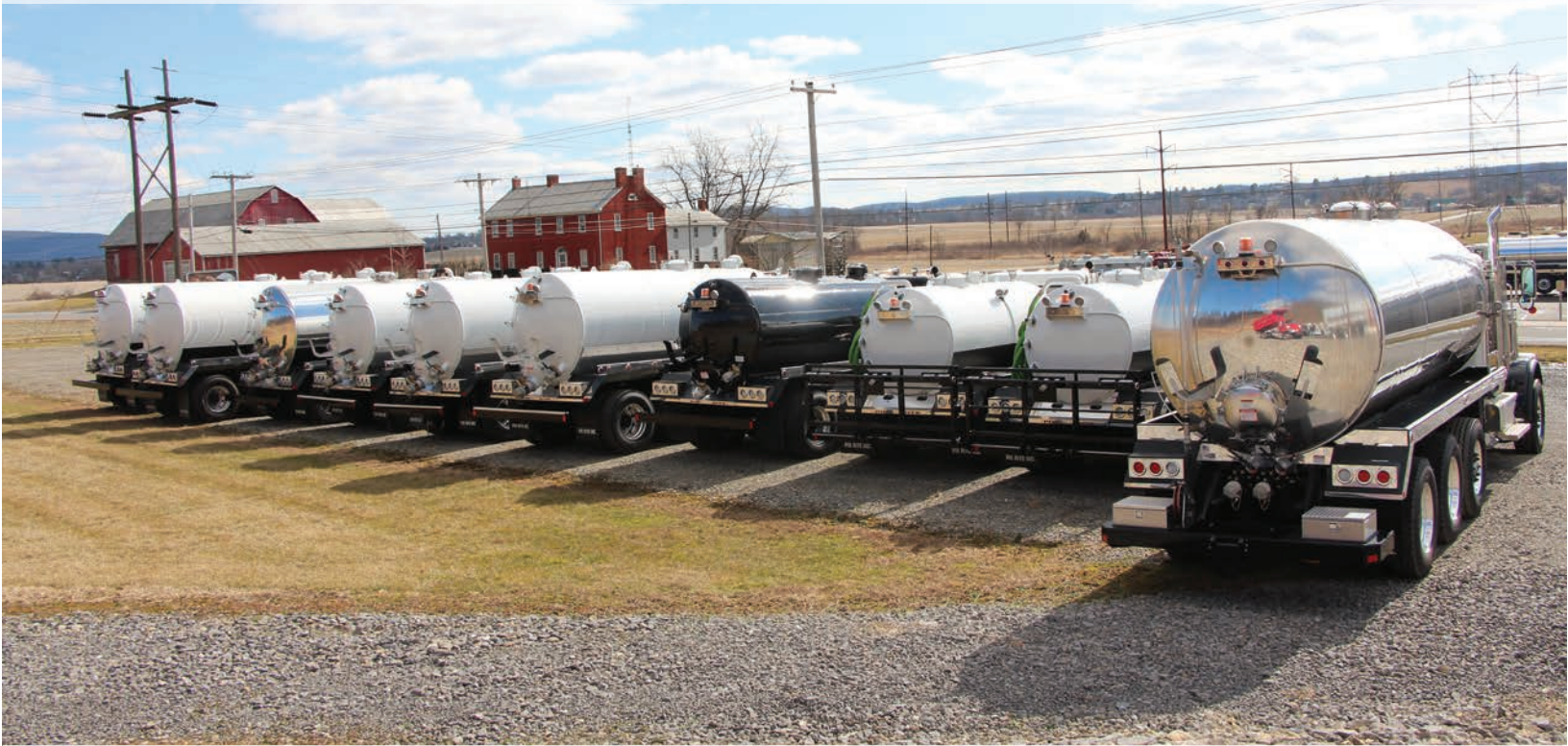
In-stock trucks ready to go to work