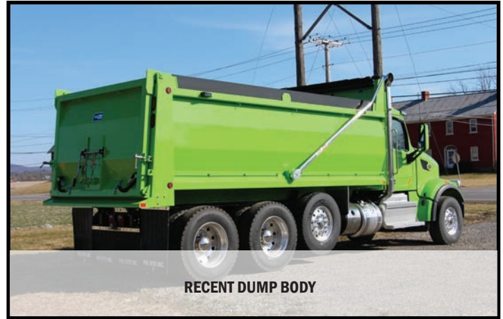
RECENT DUMP BODY

a “good enough” standard for their own tasks and that same apathetic attitude is applied to the work they do for others. The key in good service is caring. It is doing it right, even when it is hard. This department has the name Service but in reality, caring is the responsibility of each of us; in our jobs, in our homes, and in our communities. 📌