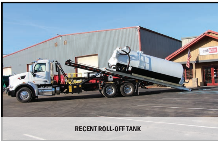
RECENT ROLL-OFF TANK

“Jehovah is my rock, and my fortress, and my deliverer; My God, my rock, in whom I will take refuge; My shield, and the horn of my salvation, my high tower.”