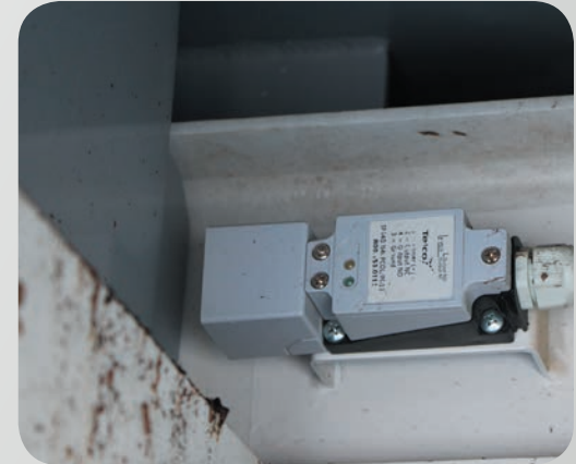
COMPACTOR SAFETY SENSOR