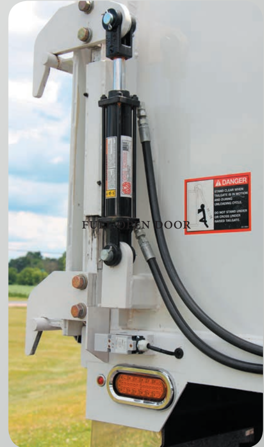
HYDRAULIC LATCH AND SAFTY SENSOR