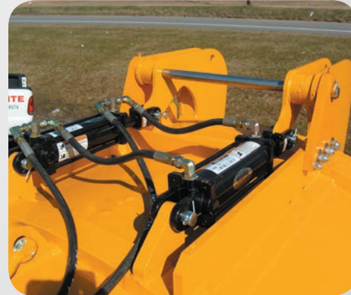
HYDRAULIC REAR DOOR